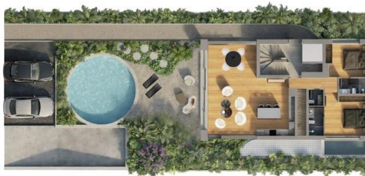
FLOOR PLAN LOWER FLOOR