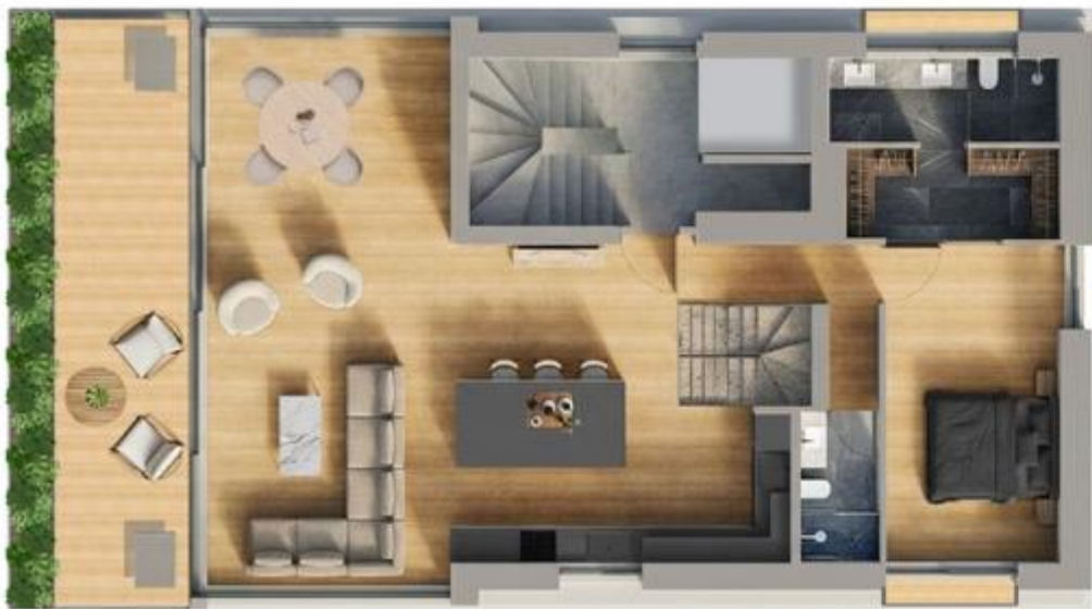
FLOOR PLAN C LEVEL