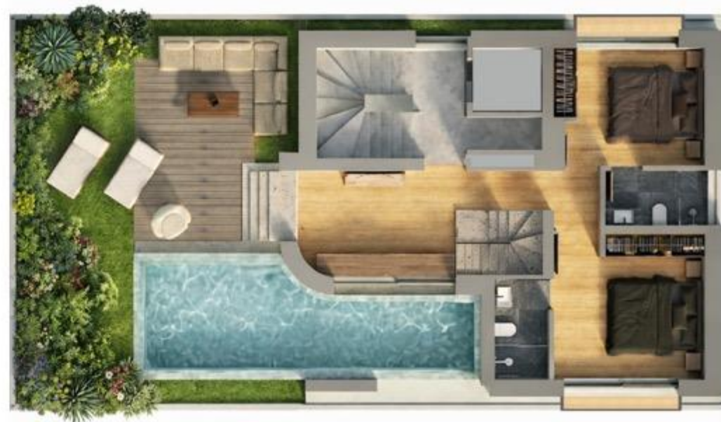
FLOOR PLAN D LEVEL